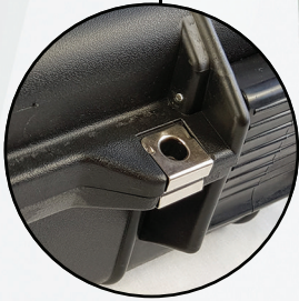
Reinforced Pad Lock Holes