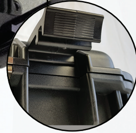
Heavy Duty Latches