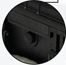
Pressure Release Valve