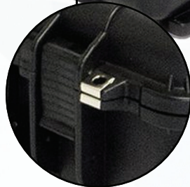
Reinforced Pad Lock Holes