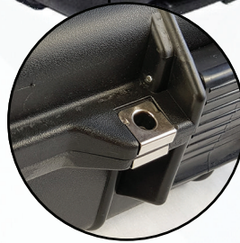
Reinforced Pad Lock Holes