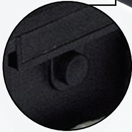
Pressure Release Valve