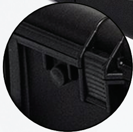
Pressure Release Valve