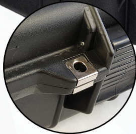
Reinforced Pad Lock Holes