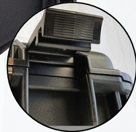
Heavy Duty Latches